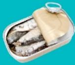
SARDINES IN SPRING WATER

TO MAKE A BATCH OF THESE TREATS, YOU'LL NEED: