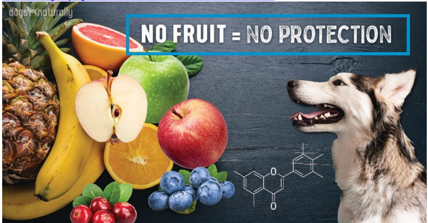
Fruits For Dogs: Research Says Feed Them!