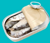
SARDINES IN SPRING WATER

TO MAKE A BATCH OF THESE TREATS, YOU'LL NEED: