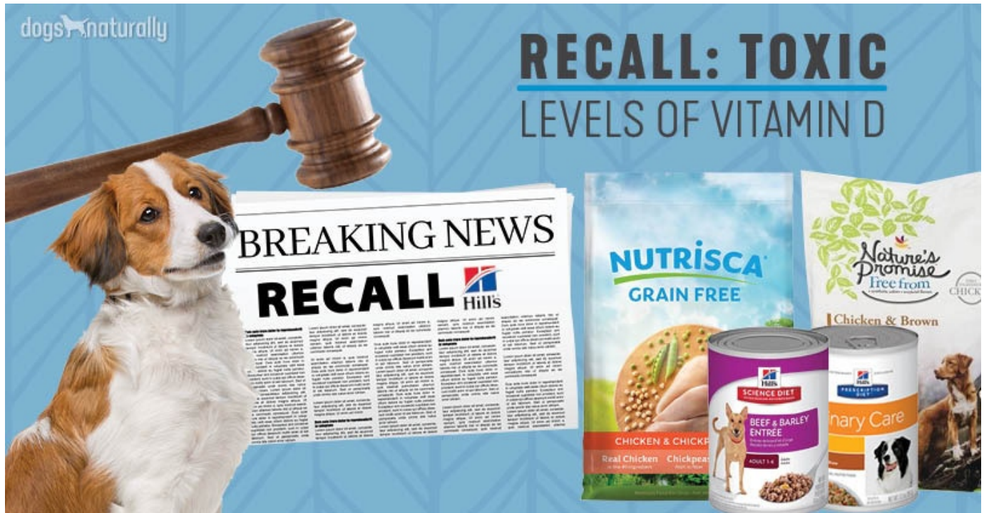
[NEWS] Dogs Dying Because Of Toxic Levels Of Vitamin D In Food